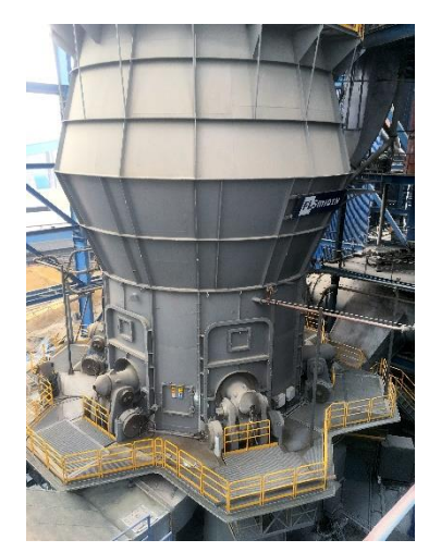
OK<sup>™</sup> Vertical Roller Mill (VRM)