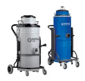
Single Phase Wet & Dry Vaccum Cleaner