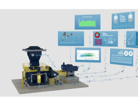
High Pressure Grinding Roll